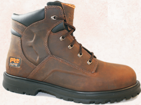
87520 6" Steel Toe Full-Grain Distressed Leather 7-11,12,13,14,15 W